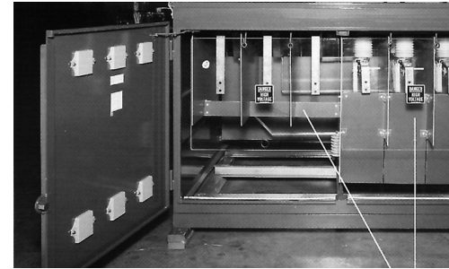
*Typical average values for 0.063" thick laminate. Properties vary with material thickness and form.

Röchling Glastic Composites 4321 Glenridge Road Cleveland, OH 44121 USA Tel: 216-486-0100 Fax: 216-486-1091 www.glastic.com