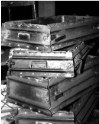
Stack of mold jackets (above), lined with Transite HT. Molds at shake-out with Transite HT bottom boards (top right). Large shell core machine with Transite HT plate (right and below).

Structural High Temperature Insulations for Foundries