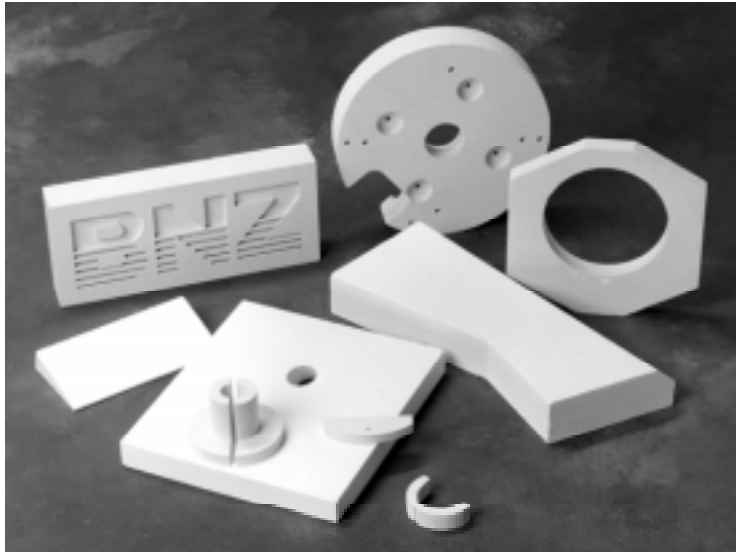
Marinite I panels can be machined into a variety of shapes

Because Marinite I panels provide excellent heat capacity and resistance to heat flow, resulting in a concentrated and